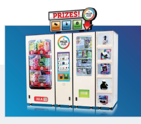
Prize Redemption Kiosks

Pack even more hours of endless fun with Air Hockey, Photo Booths, Kiddie Rides, and more!